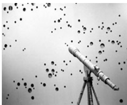
Chris Sauter, detail of "Mind and Body" (2005), drywall, screws, glue. Courtesy the artist and Finesilver/FYI.

Rosana Castrillo Diaz's two contributions to this group exhibition use the base concept of drawing—pencil marks on a flat surface—but they're scarcely visible. In fact, I didn't even notice them in my first few circles around the gallery. Her untitled works (both 2005), which are pale,